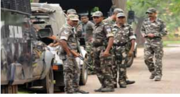
■ NEW DELHI

The Central Reserve Police Force (CRPF) has asked all its formations to recover Risk and Hardship Allowance from personnel who availed over 30 days of cumulative leave in a year.